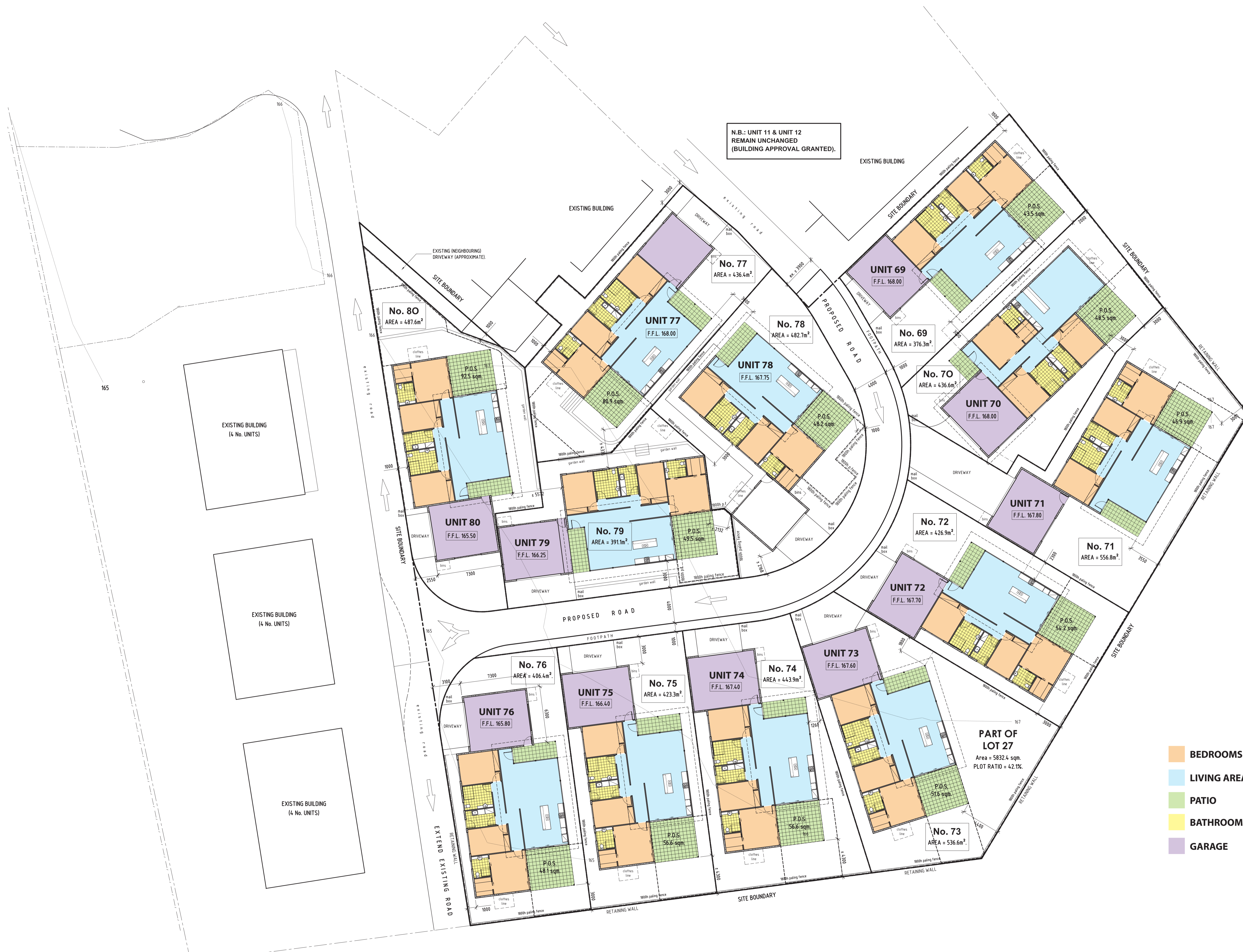
OVERALL SITE PLAN 1:200

THIS DRAWING HAS BEEN CONSTRUCTED USING SURVEY INFORMATION FROM J.B.MEDBURY Pty. Ltd. SURVEYORS - FILE REF. No. 06022.